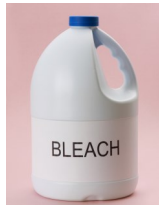
Drained / Empty

NOTE: Wet or Soiled Cardboard is Compostable.