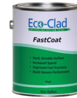
Full/Partly Full Paint Cans

Can be taken to Harlow's Enviro-Depot or the Municipal Household Hazardous Waste Depot