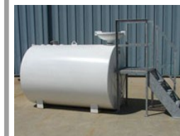
Used Boat Oil

Put in the metal barrel at your waste oil site.