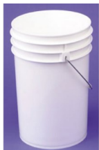
Clean broken buckets