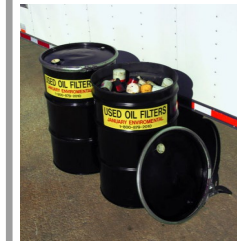
Used Oil Filters

Can be taken to Harlow's Enviro-Depot or the Municipal Household Hazardous Waste Depot