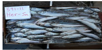
ALL Bait Boxes, Bags, Ties