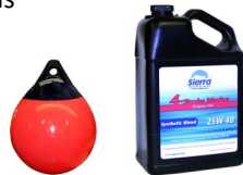
Drained Oil Cans