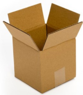
Clean /dry Cardboard